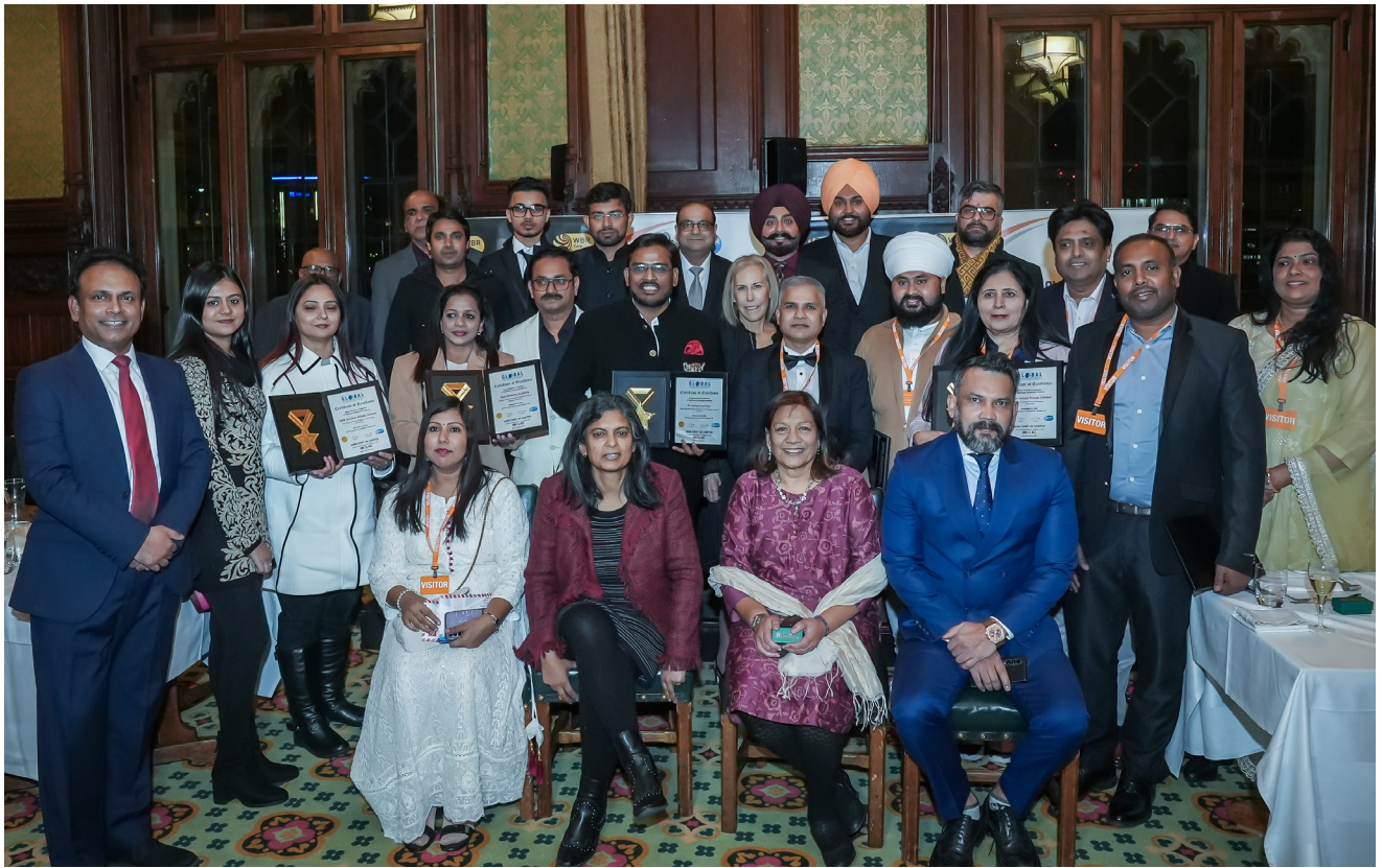
Winners and Organisers of the India-UK Global Business Awards, joined by Rupa Haq MP and Valerie Vaz MP.