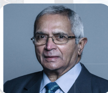
LORD DHOLAKIA Member of the House of Lords