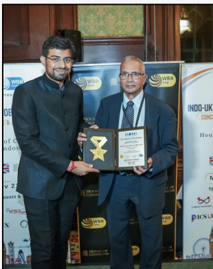
Stephens International Public School was awarded as Breaking Barriers Award for Girls Education

At the hearth of one of India's most tumultuous regions, just a stone throw distance from the Line of Control (LOC) between India and Pakistan, lies Stephens International Public School. The school epitomizes the transformative power of accessible education