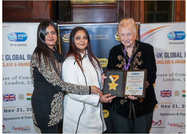
Excellence in Dermatology & Cosmetology innovation was awarded to UBIK Solutions Ltd