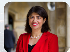
MRS. SEEMA MALHOTRA Member of Parliament (MP)