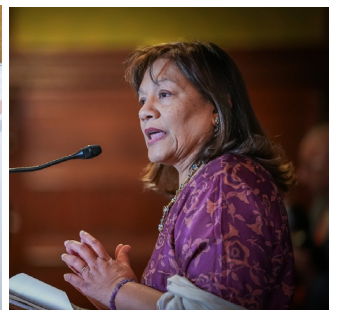
Valerie Vaz MP delivering her Keynote address

various sectors and to inspire those looking to establish or grow their presence in the UK.