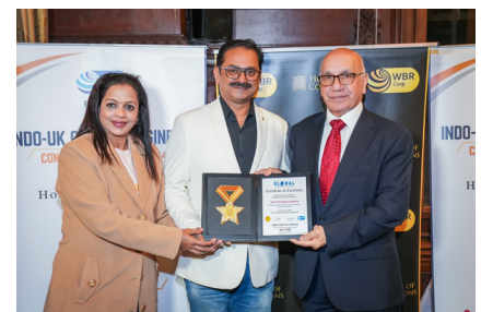
Yash Shooting Academy Leading was awarded as Professional Sports Shooting Range & Academy of the Year

In a region known for its vibrant culture and scenic landscapes, Yash Shooting Academy stands out as a unique and valuable institution. By providing world-class training and promoting a positive culture around shooting sports, it is quickly becoming an essential part of Goa's sports ecosystem. With its unwavering dedication to excellence and community engagement, Yash Shooting Academy is not only shaping the next generation of shooters but also redefining how shooting sports are perceived and appreciated in India.