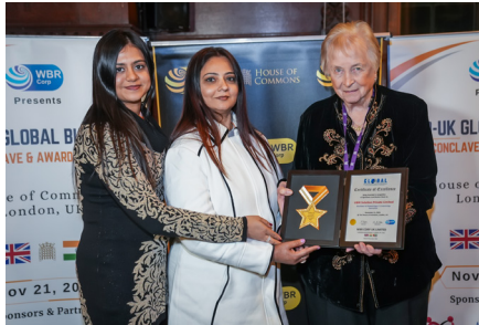
Excellence in Dermatology & Cosmetology innovation was awarded to UBIK Solutions Ltd

Solutions is its commitment to evidence-based cosmetology. Each product goes through rigorous testing phases, and only formulations that meet strict safety and efficacy standards reach the market. The company's emphasis on dermatologically tested and clinically validated products not only sets it apart but also reinforces consumer trust in its offerings. Ubik Solutions' products are designed to suit a diverse range of skin types and tones, addressing unique concerns relevant to various demographics, including products developed specifically for Indian skin, which often has unique needs in terms of melanin care, pigmentation, and sensitivity.