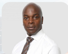
LORD SHAUN BAILEY Member of the House of Lords