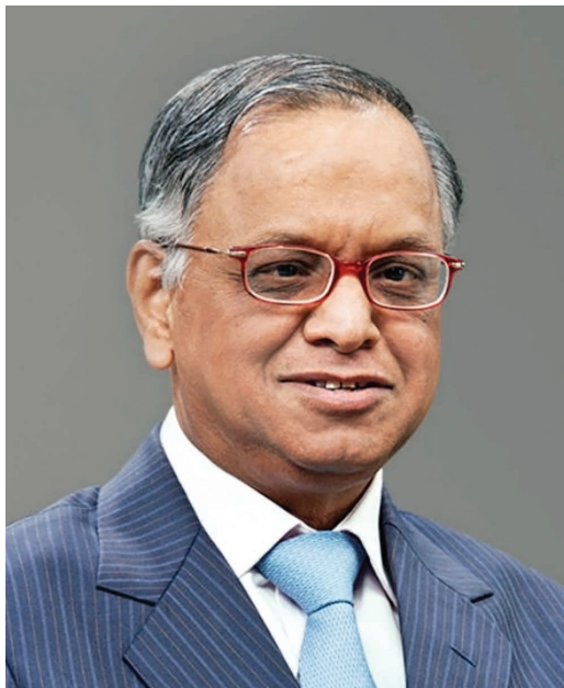
N. R. Narayana Murthy, Founder - Infosys

Infosys helps businesses to renew & improve existing conditions so that their business can achieve higher efficiencies and stay relevant according to current times. Infosys has more than 200,000 employees and through their hard work & dedication, Infosys has grown to become a US $10.9 billion (revenues FY18) company with a market capitalization of US $39 billion.