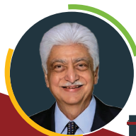
Azim H. Premji Founder Chairman, Wipro