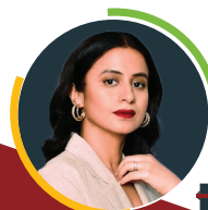
Rasika Dugal, Indian Actress