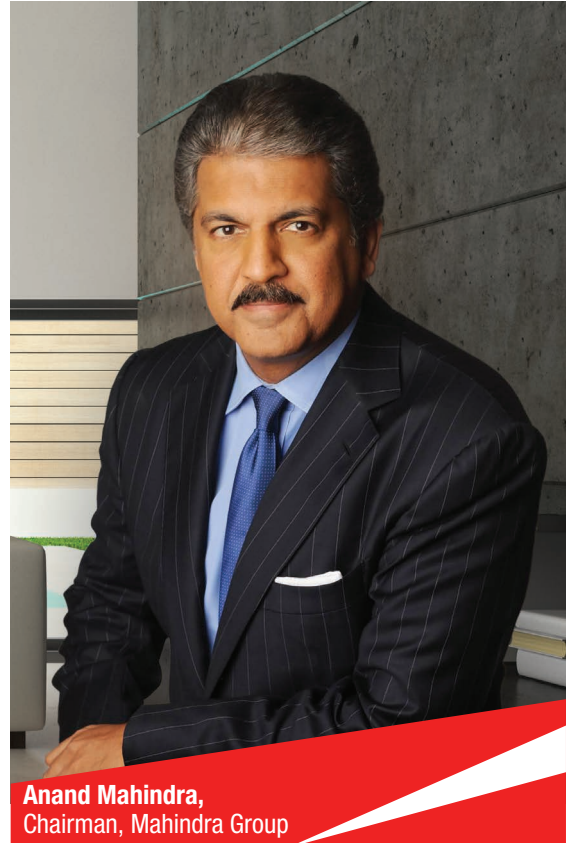
Anand Mahindra, Chairman, Mahindra Group