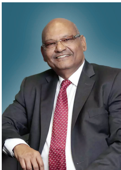
Anil Agarwal, Non-Executive Chairman

good move. The company is committed to bring in future investments of up to USD 20 billion dollar across its businesses. While addressing the shareholders during 56th Annual General Meeting of the company the Chairman outlines that the outlook for mineral-led growth is looking robust, and