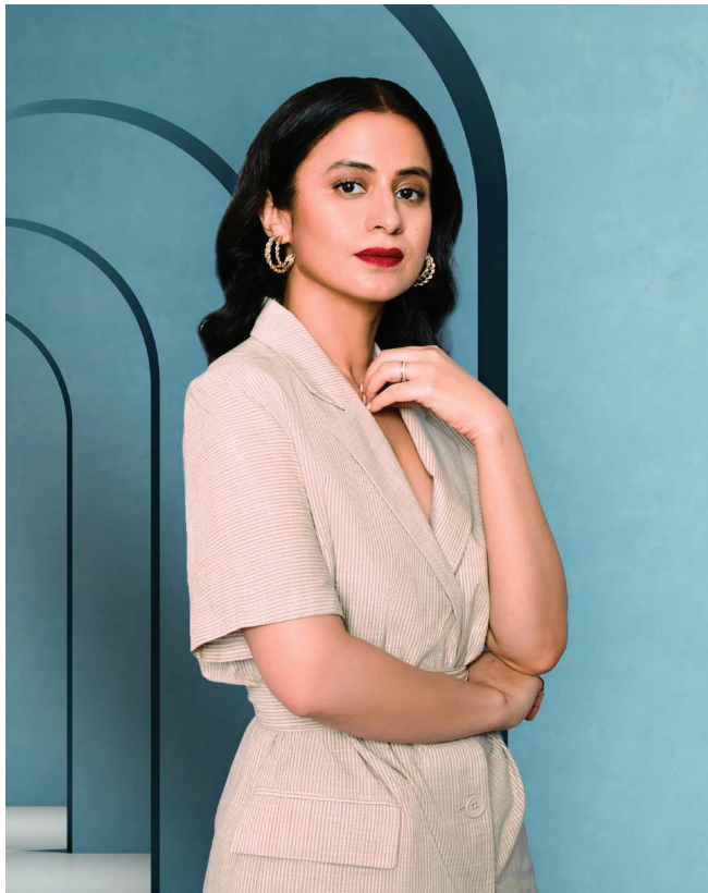
Rasika Dugal, Indian Actress

R asika trained in Acting at the Film and Television Institute of India (FTII, Pune). She currently lives in Mumbai. She has played significant roles in films, original series and short films, exploring the nuances of diverse characters in artistically challenging and socially relevant productions. She is known for her performance in feature films 'Manto' (directed by Nandita Das), 'Hamid' (directed by Aijaz Khan), 'Qissa' (directed by Anup Singh), 'Kshay' (directed by Karan Gour), 'Lootcase' (directed by Rajesh Krishnan) and short films 'Chutney', 'The School Bag' and 'Banana Bread'.